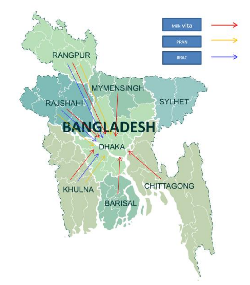
Figure 3 – Milk collection network for the top three local commercial players in Bangladesh<sup>249</sup>

In regards to the modern milk market model, distribution and sales are, besides imported brands, dominated by local processing companies such as Milk Vita, Aarong Dairy and PRAN Dairy Ltd. The milk collection network of the top three local commercial players in Bangladesh is illustrated in the figure below, which clearly shows that raw milk is being transferred from rural areas, processed, and then distributed in urban areas, especially in Dhaka.