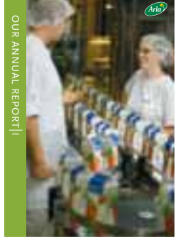
»OUR BRANDS 2006 « is a supplement to Arla Foods' formal accounts and report, »OUR ANNUAL REPORT 2006 «. The Annual Report can be ordered from Arla Foods or downloaded from www.arlafoods.com.